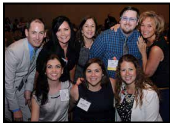
PCMA / PMPI Disney Quest for Talent program on May 27