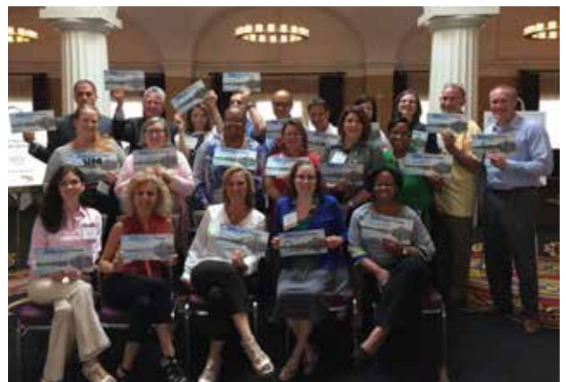
Capital Chapter Mid Year Board Retreat, held on June 1 at the Hotel Monaco, Washington DC