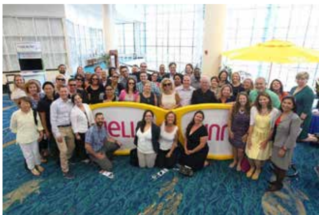
Capital Chapter at PCMA Education Conference, June 14-17 in Fort Lauderdale, FL